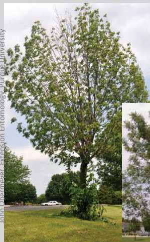
These ash trees are too unhealthy to be effectively treated.