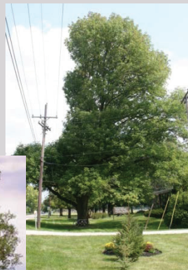
This ash tree is not planted on the right site. It will require maintenance to keep it clear of power lines.

Contact your city forester about local ordinances before performing any tree work!